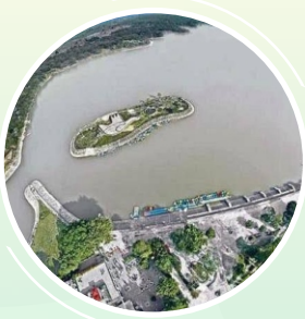
SUKHNA LAKE CHANDIGARH