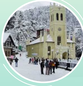
QUEEN OF HILLS SHIMLA