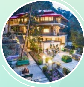
KASAULI, HIMACHAL PRADESH