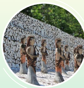
ROCK GARDEN CHANDIGARH