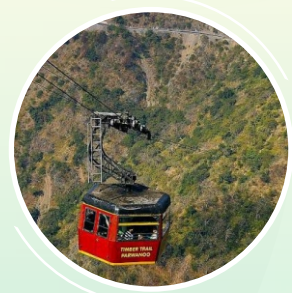
TIMBER TRAIL, CHANDIGARH