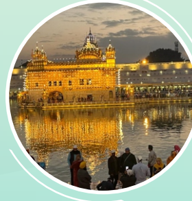
GOLDEN TEMPLE AMRITSAR