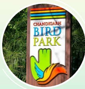
BIRD PARK, CHANDIGARH